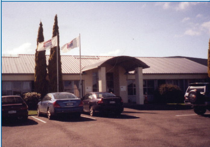
AFFCO's processing plant in Manawatu, New Zealand.

Western Australia - cattle are raised on large cattle stations, and graze on open-range grasslands. In southern Australia - New South Wales and Victoria - cattle are raised on smaller farms and are grain fed. Cattle from southern Australia are generally younger and smaller in size, and are used for the domestic and Japanese markets. Australia, while famous for its pasture-feed cattle, has seen the use of feedlots dramatically increase during the last two decades.